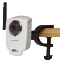
AXIS 207/207W Network Camera with flexible clamp - clamp included