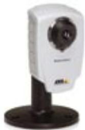
AXIS 207/207W Network Camera with camera stand - stand included